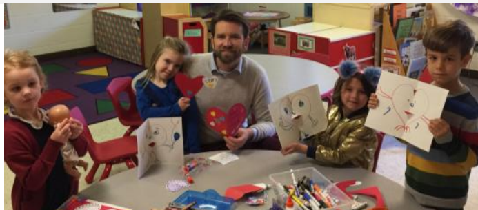
Making Valentines for Serve Saturday | January 26