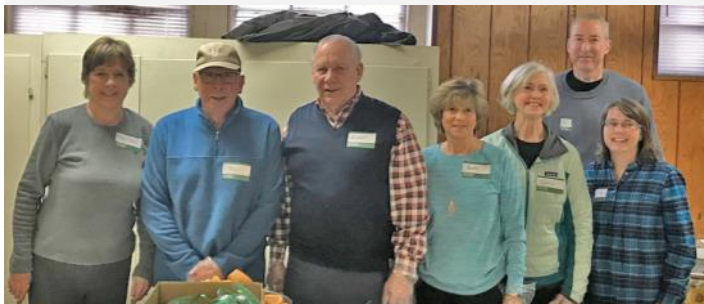
Friends of the Homeless Serve Meals | January 23

Bring in new or gently-used plastic containers, so that meal attendees can take extra food to eat later. Containers may be donated in the bin near the elevator on the red carpet hallway.