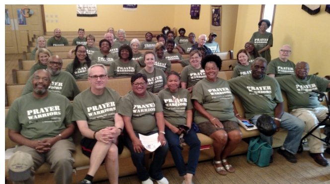
Praying with a Community Swansboro Prayer Walk

The annual Mission Benefit Concert was a real triumph for our music ministry. Our Chancel Choir, along with guest musicians, sensitively rendered significant choral music from three different eras of music, and our Reveille Ringers amazed us with their exceptional skill on handbells.