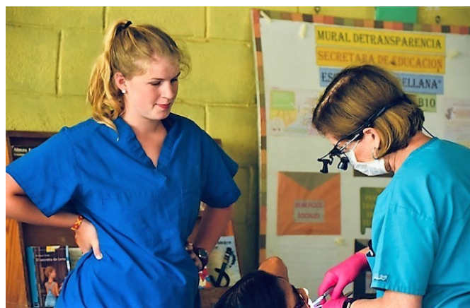
Medical Care in the Mountains of Honduras Friends of Barnabas

Twenty-four campers were bubbling with excitement, laughter, smiles, and even tears on the final night because they had a perfect week at Westview and did not want it to end. Know that you made a difference in these kids' lives!