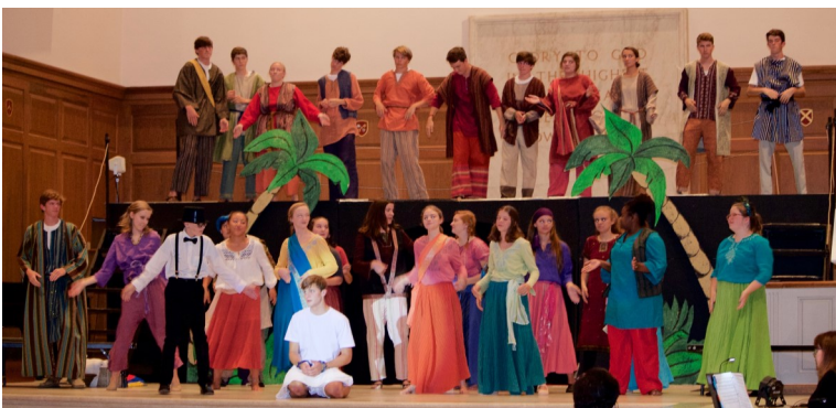
Youth Musical Joseph and the Amazing Technicolor Dreamcoat

Here are just a few of the things you made possible this year: