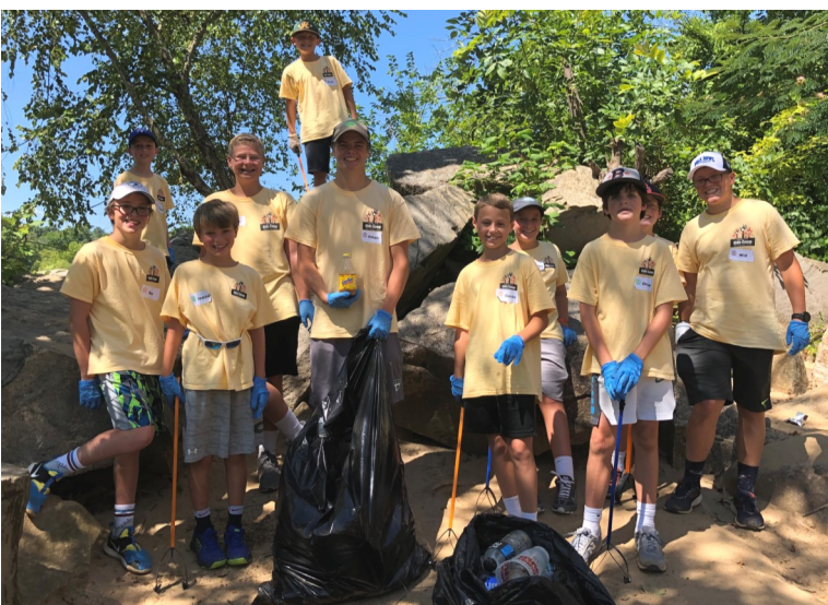
Doing All the Good They Could Kids Camp

In February, members of Reveille, Koinonia Christian Church, and Love Center of Unity grew in understanding and friendship as they dined together and learned more about the traditions and history of each other's churches.