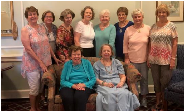
Mary Lou White Circle