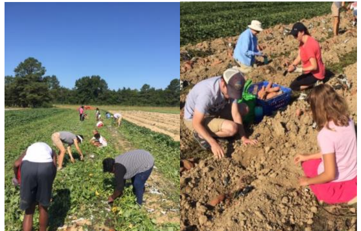
Partner Churches at Shalom Farms