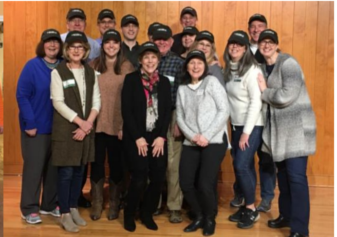
Church Council Retreat