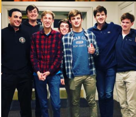
Left: Reveille’s youth upperclassmen small group.