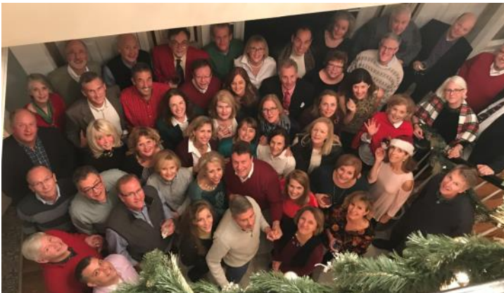
Christmas at Reveille