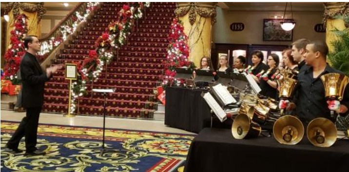
Reveille Ringers at The Jefferson Hotel