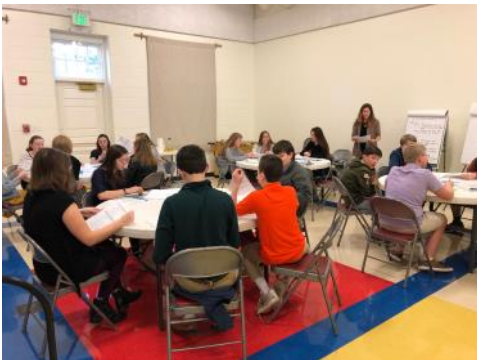
Above: The 2019 confirmation class has 20 students learning about our church and discipleship.

Join us for Youth Sunday on February 24, during the 11:00 am worship service. Reveille’s youth ministry will plan all components of the service. The sermon will be from our “Why Church?” series. Don’t miss it!