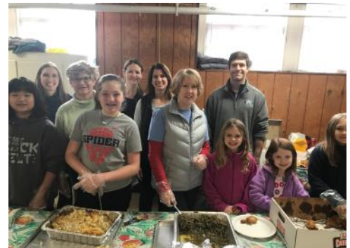
Friends of the Homeless