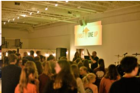
Top Center: Over 100 youth from Reveille and Trinity UMC celebrated winter kickoff with Collective 360.