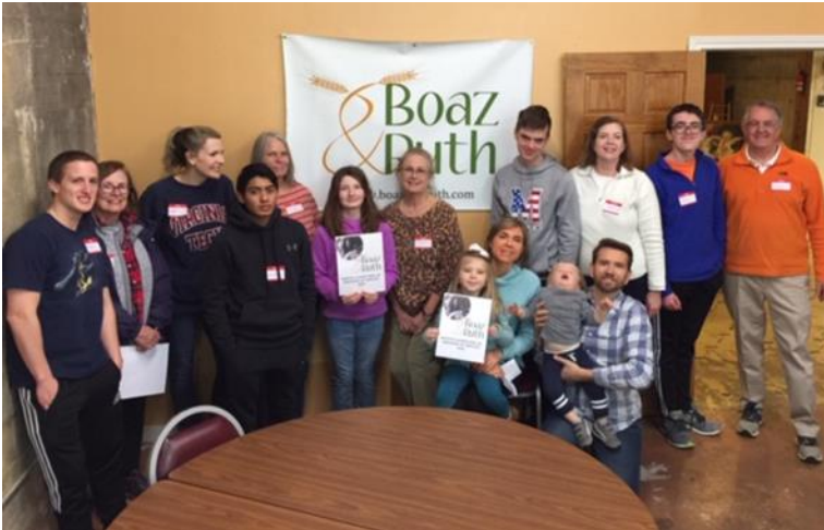
Serve Saturday at Boaz & Ruth